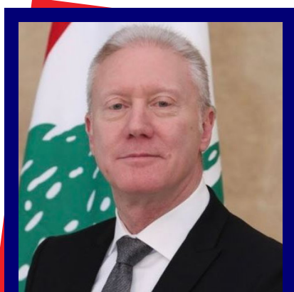
H.E. Mr. Youssef Rajji